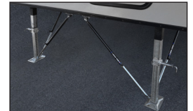
2 Boxes for Front