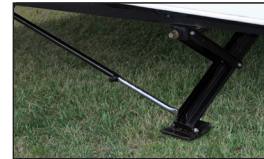
1 Box for Rear