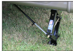
1 Box for Front