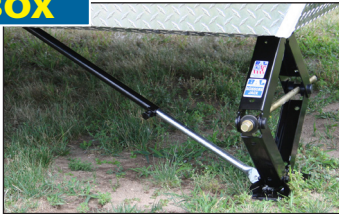
1 Box for Front OR Rear