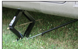
1 Box for Rear