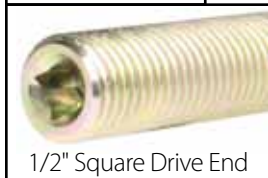
1/2" Square Drive End